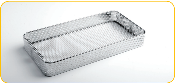
Stainless steel instrument baskets