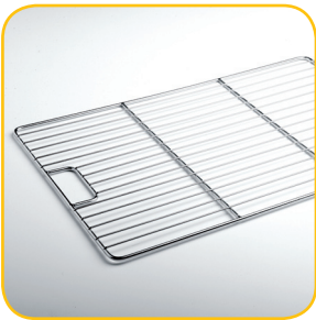
Stainless steel wire shelves

The UFlex III system stands for quality, flexibility and durability.