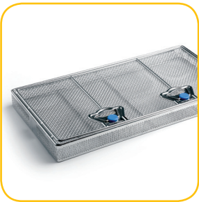
Fine mesh trays