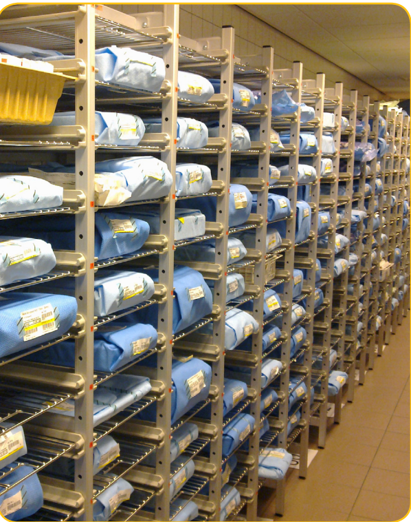
Sterile room with ISO D-type