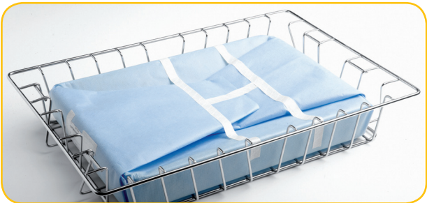
Stainless steel wire baskets